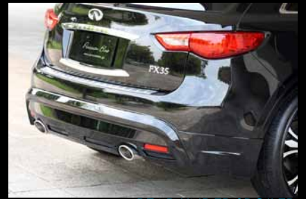
REAR UNDER SPOILER