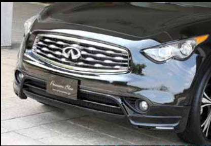
FRONT HALF SPOILER